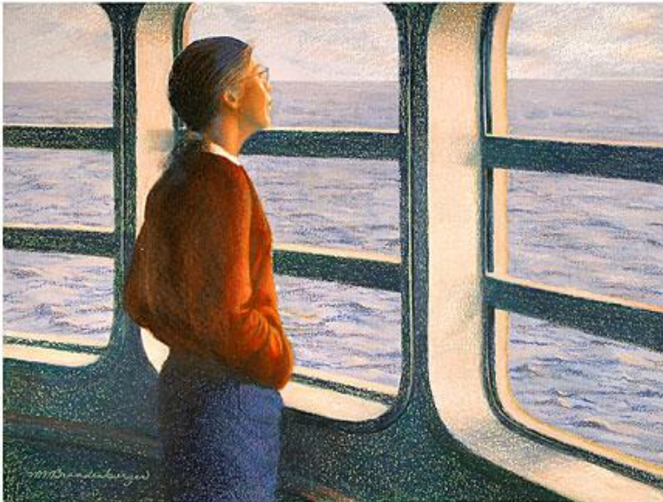
Island Dreaming © 2005 18 x 24 oil pastel/gouache on panel

What I mean by "mixed media" is that I lay down color in another medium and then work the oil pastel on top. What happens with this technique is that tiny bits of the under-color show through the oil pastel, adding a color sparkle that just seems more interesting than solid oil pastel. This under-color can be a loose, washy painting or a solid layer of color. For the washy paintings, I have used watercolor, gouache and acrylic, and, most recently, Holbein's acrylic gouache (yes, there is such a thing). I apply the latter over a pastel ground to give the acrylic some tooth. For the solid color I use Colourfix primer. This wonderful stuff comes in jars, in dozens of colors, is easy to apply with a brush, adheres to most dry surfaces and dries to a nice toothy finish that is just great for oil pastel.