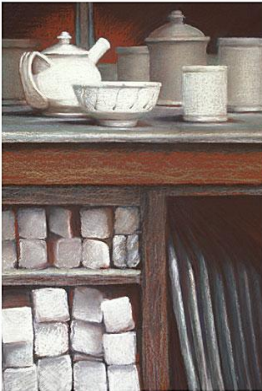
Three Part Harmony © 2004 18 x 12.5 oil pastel on panel