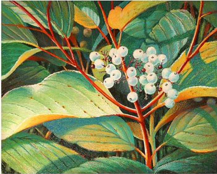
Red Stem Riot © 2005 16 x 20 oil pastel/gouache on panel

I see that you have a very extensive website that you share with your husband. Has this helped you build your business?