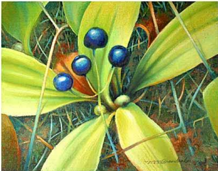
Blue Bead Bonanza © 2005 11x14 oil pastel/acrylic on canvas panel

The way I design a painting is a structured process as well. I reread my journal, pull out my resource photos, select one or several images and develop a value study from them. The value study often undergoes many variations until I'm satisfied. Then I usually do a color study — not always, because sometimes I feel "sure" of a design and want to get right into putting color on a surface — but I find color studies help me focus on what I want to achieve in a painting: a sense of place, a palpable quality of light, an underlying abstract design and rich value contrasts.