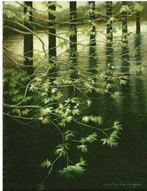
Under the Bridge © 2004 18" x 14" oil pastel on linen

"Under the Bridge" depicts a scene at the Sandy Creek Nature Center, near Athens, Georgia, where the creek runs under a highway. The painting came about as a sort of experiment. I had been doing my oil pastels on paper, but had just started experimenting with panels. An artist friend suggested I try an oil-primed canvas mounted on panel. I didn't like it at first — the oil pastels slithered around on the canvas too much — but the experience kicked off a year of experimentation in which I tried just about every panel made to see which worked best with oil pastel. It's interesting that you think it looks like it was done in colored pencil, because if you saw it "in person" you might guess it is an oil painting. But that's one of the problems with online images; textures appear flat.